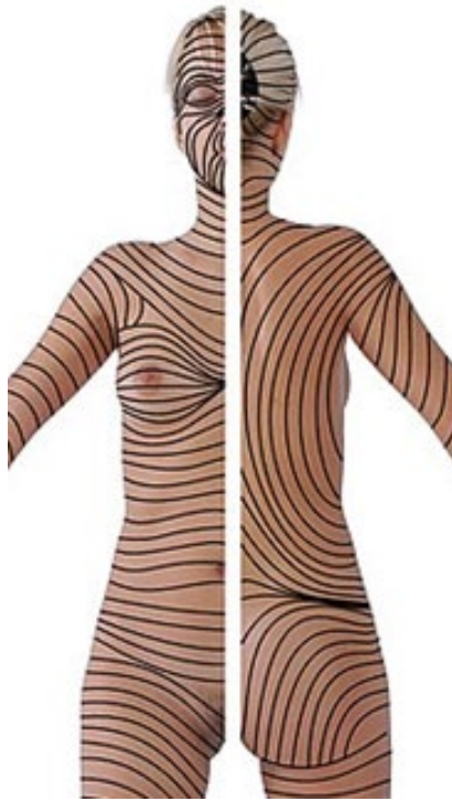
Figure 1. Langer Lines