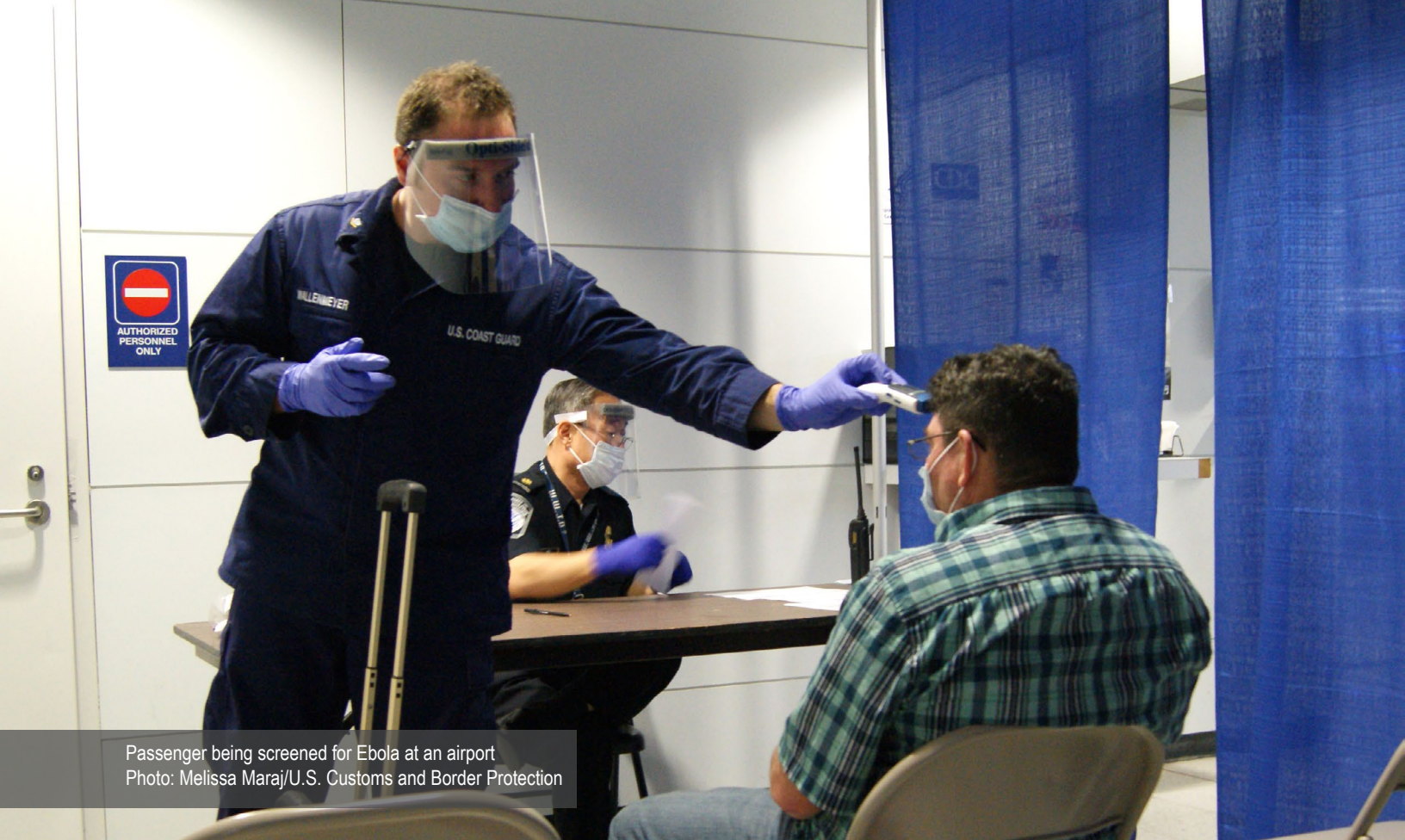
Passenger being screened for Ebola at an airport