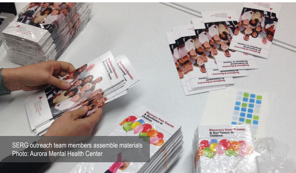
SERG outreach team members assemble materials