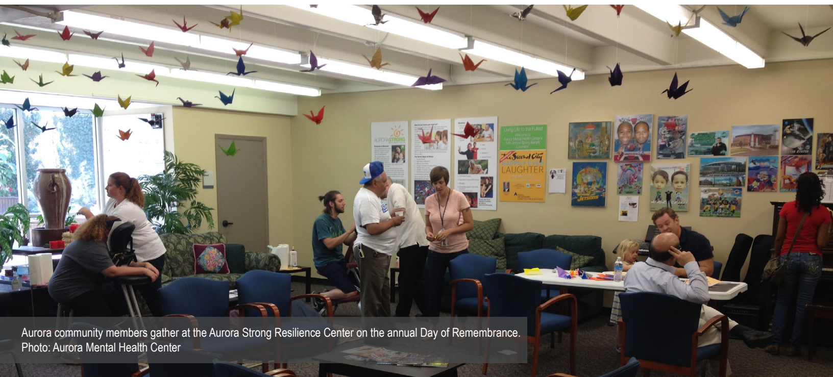
Aurora community members gather at the Aurora Strong Resilience Center on the annual Day of Remembrance.