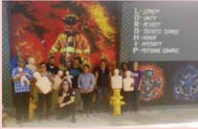
May 21, 2018 – DFEMS Firefighters conducted Adult & Infant CPR and AED certification courses for NMPASI Staff in conjunction with May as EMS awareness month.