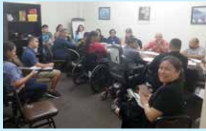
May 22, 2018 – Collaborating partners gather at NMPASI conference room for their weekly planning meeting for upcoming Disability Sports Fest (July 6 – 8, 2018)