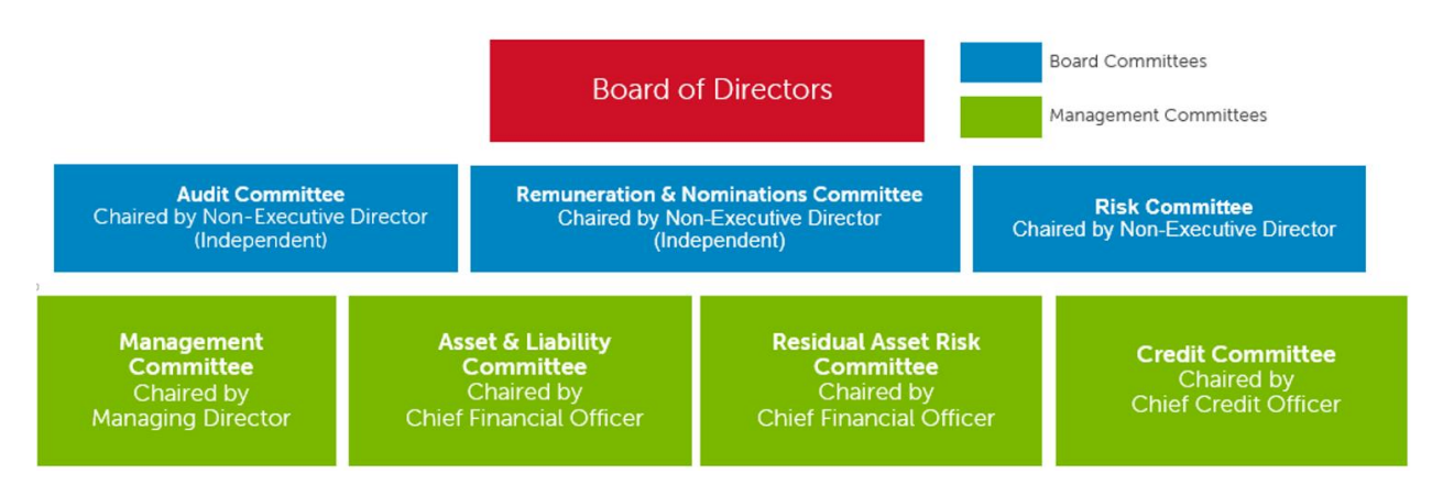
Diagram: Oversight and Information flow – Management Committees

The chart below displays the Bank's three lines of defence model.