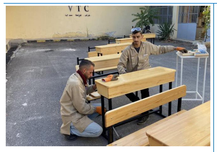
Trained displaced persons and returnees manufacturing desks for a rehabilitated school in Aleppo Governorate.