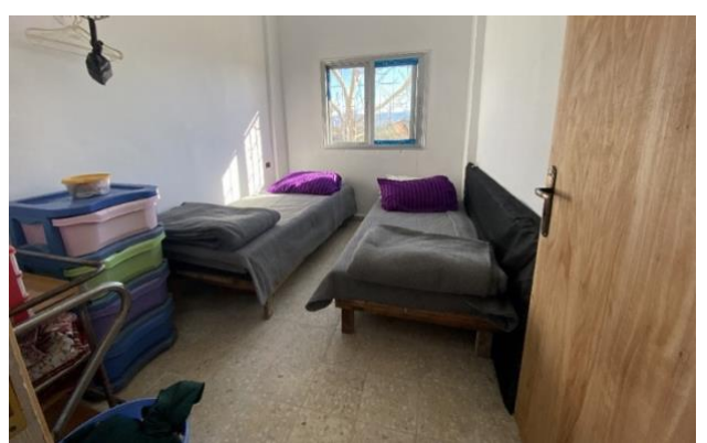
A house of an internally displaced family in rural Latakia Governorate after being repaired by UNHCR

Since January 2023, UNHCR repaired 2,270 damaged houses, installed around 4,660 shelter material packages and repaired over 180 communal areas within the damaged apartment buildings. Returnee families also benefited from the installation of over 4,340 solar streetlights and two transformers in their areas.