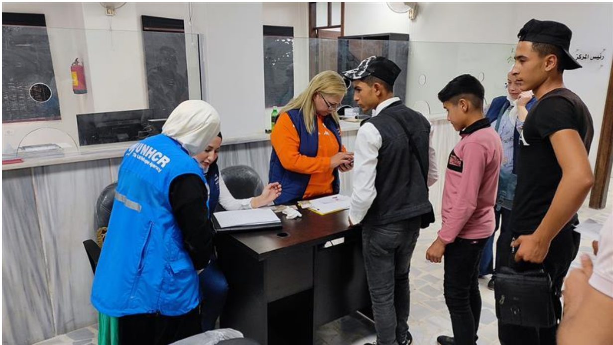
Legal support for issuing civil documentation/IDs for the students coming from neighbouring countries to sit for national exams.

The legal services are offered in different forms, including legal interventions and representation before courts and other governmental bodies, individual legal advice , and legal awareness-raising sessions. Interventions before courts or other governmental bodies support vulnerable individuals who have protection concerns, limited capacity to follow the legal procedures and requirements, difficulties reaching the administrative and legal bodies, or who encounter financial constraints.