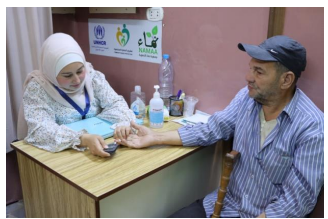
Health counselling at As-Sukkary health point, Aleppo Governorate.

More than 17,000 individuals participated in and benefited from the community-based health promotion and disease prevention activities at 38 health points at UNHCR-supported community centres. In addition, over 1,250 individuals benefited from basic medical and psychiatric consultations.