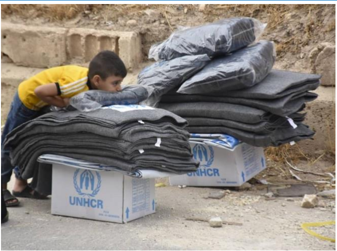
Distribution of winter items to IDPs in Morek, Hama Governorate. The items include extra high thermal blankets, sleeping bags, waterproof floor covers, extra plastic sheeting, portable heaters, rubber boots, and winter jackets.