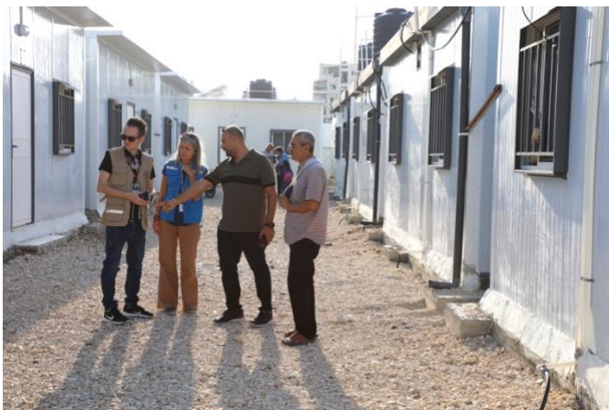
UNHCR visiting earthquake-affected families living in prefabricated units in Al-Naq'a in Jableh city (Latakia Governorate).