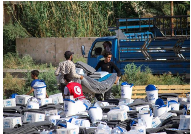
Distribution of core relief items during the emergency in rural Deir-ez-Zor Governorate.

Clashes erupted on the eastern bank of the Euphrates river (Deir-ez-Zor Governorate) and along the border with Iraq, causing fatalities and forcing thousands of civilians across the river to seek safety. As of end-September, UNHCR has registered over 3,000 newly displaced families and distributed around 2,500 kits of core relief items. The items will protect around 13,500 people from harsh weather and alleviate challenges during displacement. UNHCR is proceeding with further distributions, prioritizing people from the most affected areas.