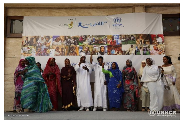
A talent show was held at a UNHCR-supported community centre in Damascus on 20 June, World Refugee Day. See more stories and photos from World Refugee Day in Syria here.

dish. Meanwhile in Qamishli, young people united over sports and over 400 refugees and Syrians participated in athletic races and games.