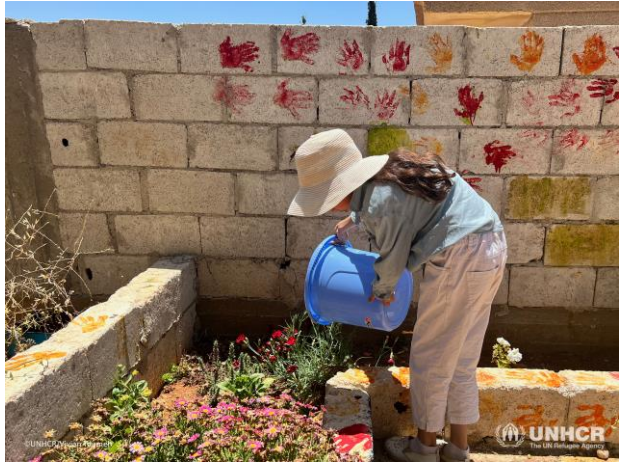
A UNHCR-supported community centre in Damascus organized environmental awareness activities on 5 June to mark International Environment Day.

• In collaboration with partners, UNHCR is in the process of relocating two community centres in Dar'a and As-Sweida Governorates to reach additional people in need of protection services, mainly IDP returnees in underserved areas. The new locations were selected following assessments of the areas, severity of needs and population concentration in the surrounding areas.