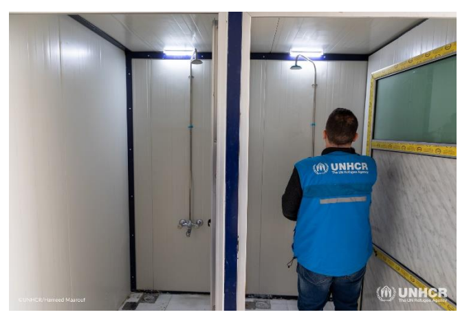
Installation of showers at a collective shelter hosting people affected by the earthquakes in Aleppo.