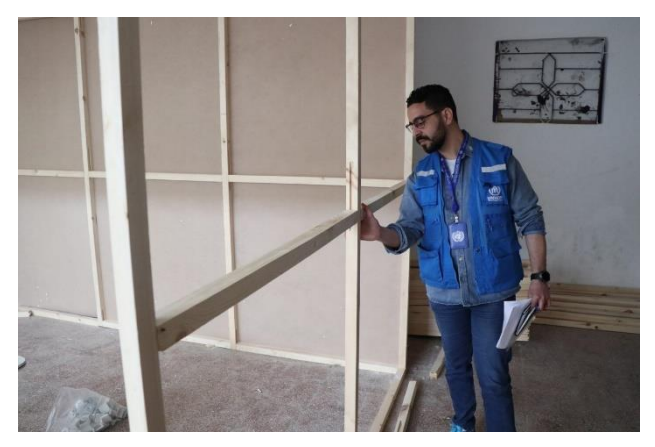
Partitions installed for added privacy at a collective shelter in Latakia.

washing facilities. Interventions were informed by UNHCR's findings through safety audit assessments, which identified an increased risk of gender-based violence and sexual exploitation and abuse incidents inside the collective shelters.