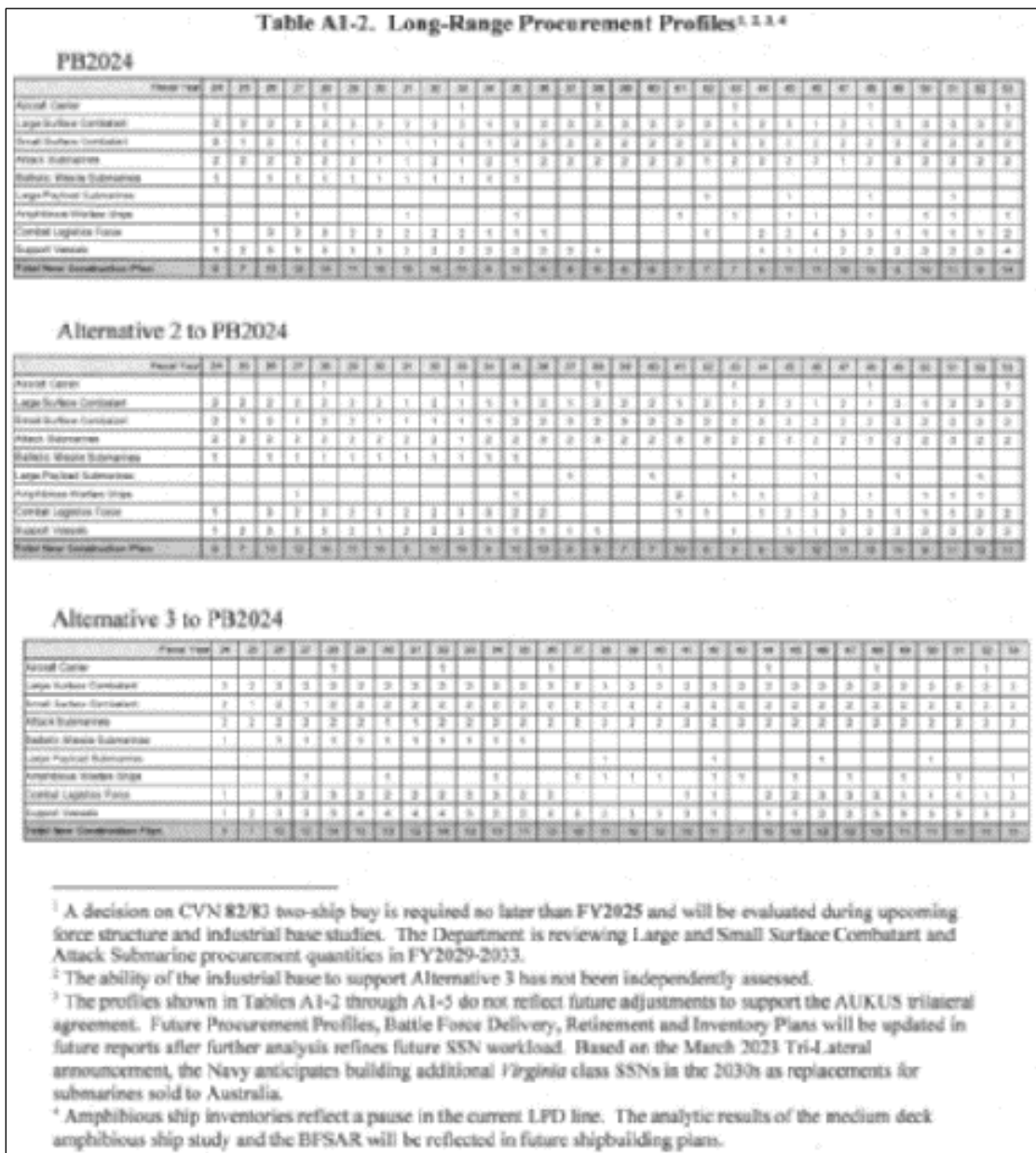
Figure 2. Alternative Shipbuilding Profiles in 30-Year Shipbuilding Plan As shown in Navy's FY2024 30-Year Shipbuilding Plan

Source: U.S. Navy, Report to Congress on the Annual Long-Range Plan for Construction of Naval Vessels for Fiscal Year 2024 , March 2023, with cover letters dated March 30, 2023, released April 18, 2023, pp. 15-16.