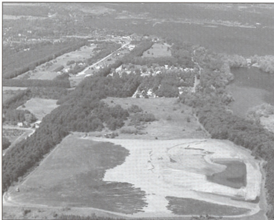
St. Paul District file photo