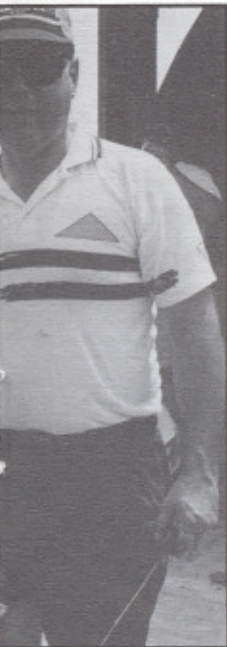
Visual Information photo nd chicken. Heitz- logy Branch (PE-H).