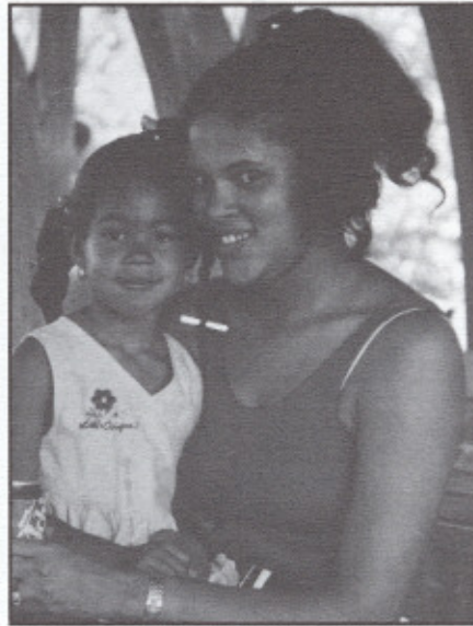
Visual Information photo

Children's games, golf, volleyball, fishing, hiking, horseshoes and baseball provided opportunities for team building.