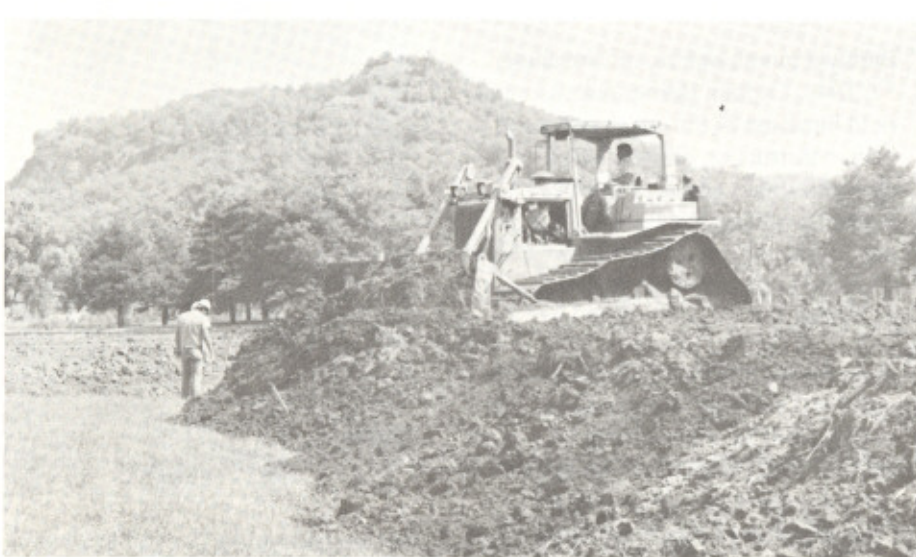
Excavated material is monitored for archeological evidence at one of the disposal areas for the State Road Coulee Flood Control Project.

Yet for all the knowledge that has been found, examined and catalogued in almost a decade of work, questions about the Oneota remain. When did these people leave the area and where did they go? Were they the ancestors of the Ojibwe, Dakota or other tribes that now claim these same lands as their home, their heritage? Perhaps these questions will be answered through the work of Corps archeologists as they uncover and excavate new field sites in the years to come.