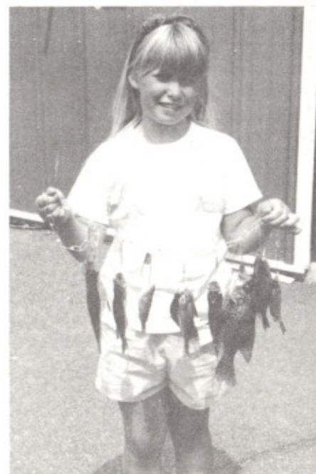
A participant in this year's fishing contest for kids at Crosslake Recreation Area proudly displays her catch.