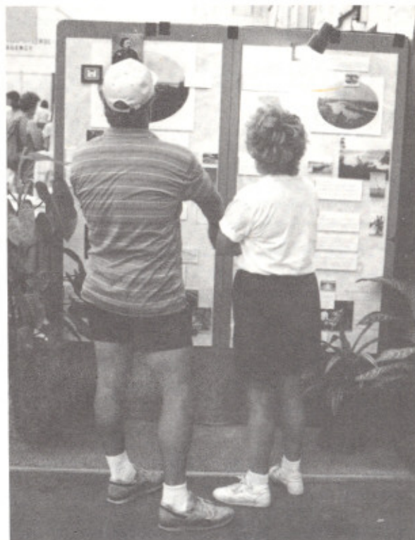
Visitors to the Corps display at the 1991 Minnesota State Fair view two panels of photographs and descriptive text that illustrate both the history of the St. Paul district and its current mission and activities.