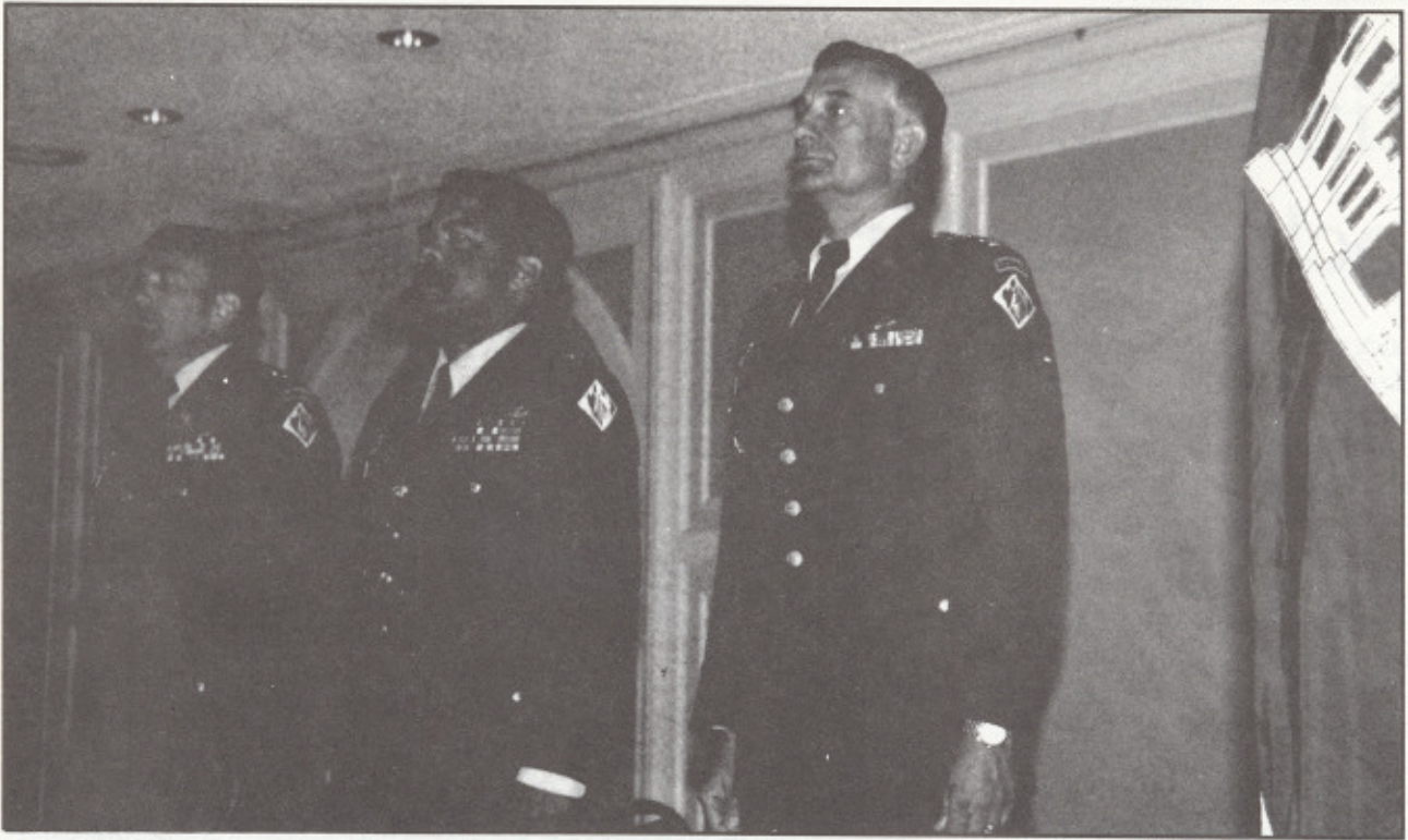
The official party during the Change of Command Ceremony on July 9: Colonel Craig, General Patin, Colonel Baldwin.