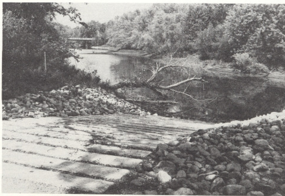
The new boat launch in the South area gives boaters access to the Sandy River and, a half-mile downstream, the Mississippi. It should experience a lot of use this fall, when the river level rises again.

In the July issue of Crosscurrents , we featured a story by Park Ranger Terry Ladd on new developments at Big Sandy Lake. Now you can see those improvements for yourself.