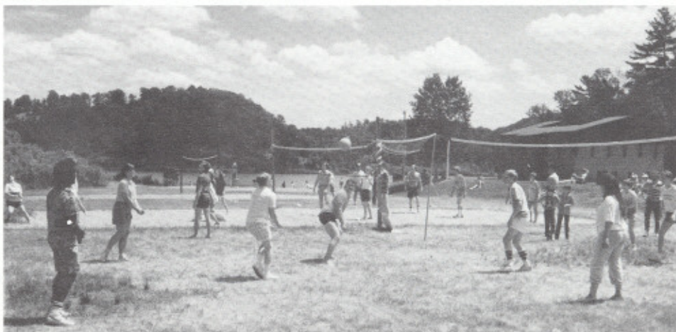
The annual District picnic moves to Eau Galle Lake, where fun prevails.

celebrating the 50th Anniversary of the completion of the 9-Foot Channel.