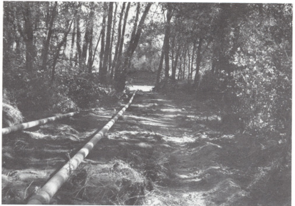
A pipeline connects the Red River of the North to the water treatment plant at Pembina, North Dakota.

The Pembina Emergency Assistance Project was the second to be authorized in the nation and the first to be completed, remarkably all within nine days. The summer's drought reduced the flow of the Pembina River to nearly zero, thus imperiling Pembina's primary water supply. The Red River of the North, with a larger drainage basin and three Corps reservoirs providing low flow releases, could, however, provide relief if a connection was made. On Tuesday, September 20th, a $12,900 contract was awarded to install a 1,100 foot temporary pipeline connecting the municipal water treatment plant with the river. By Saturday, Red River of the North