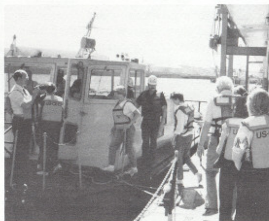
In July, District employees tour the dredge "William A. Thompson" near St. Paul.