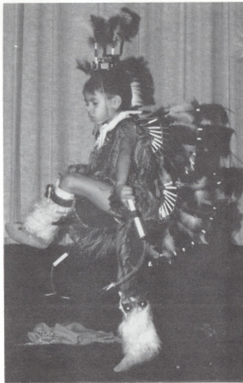
A serious young dancer from the Red School House.