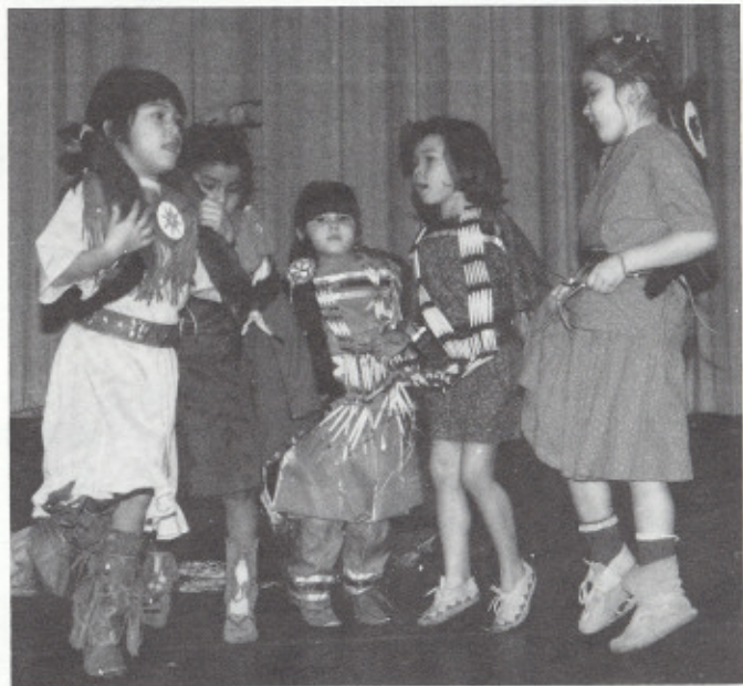
Young Indian "maidens" perform traditional dances.

The observance of American Indian Heritage Week, November 14-18, had good participation from district employees, with approximately 400 people attending throughout the week. Program offerings were designed to enlighten, educate and entertain.