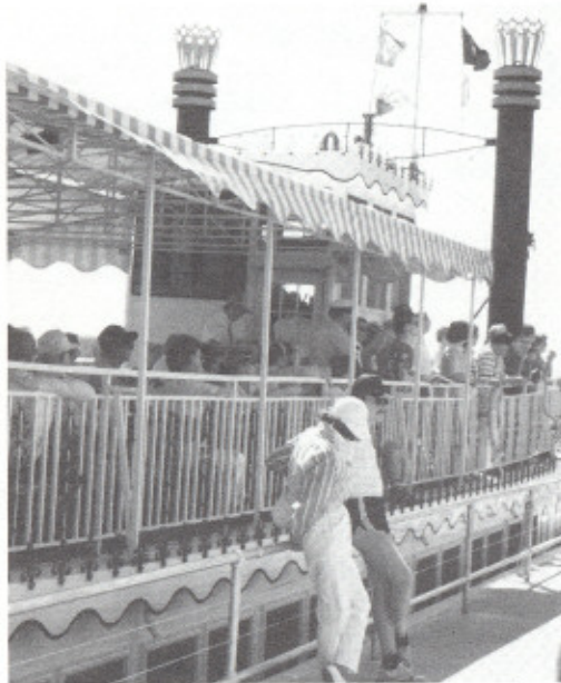
Over 100 employees tour the river aboard the "La Crosse Queen" during the 50th anniversary celebration in June.