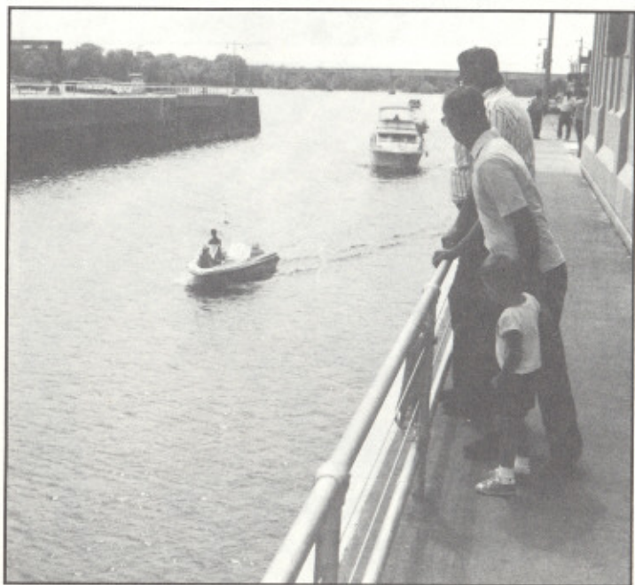
Approximately 2,200 visitors toured the lock and dam facilities on June 25 and 26. Many witnessed recreational and commercial lockages.