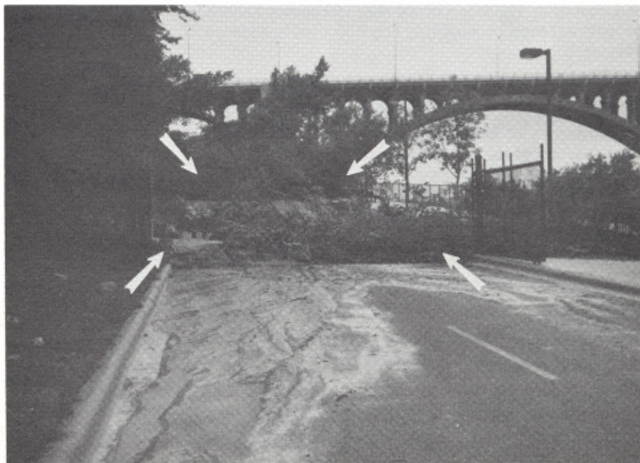
When storms dropped 9-12 inches of rain on the Twin Cities area on Thursday, July 23, at least one Corps project was affected. Mud slides caused minor damages, but a major inconvenience at Lock and Dam 1. In the photo, the upper arrows point to the slide that blocked the road that leads to the lock and the lower arrows show where the gate area was also blocked by mud and uprooted trees and bushes. Employees who had been working the night of the storm were not able to get their cars out of the lock's parking area until late Friday afternoon when the access road was cleared. The downpour caused the Mississippi River to rise approximately four feet in a couple of hours.

I am not signing my name, because I feel that I speak not only for myself, but for all who attended the information sessions when I say thank you to the team of presentors.