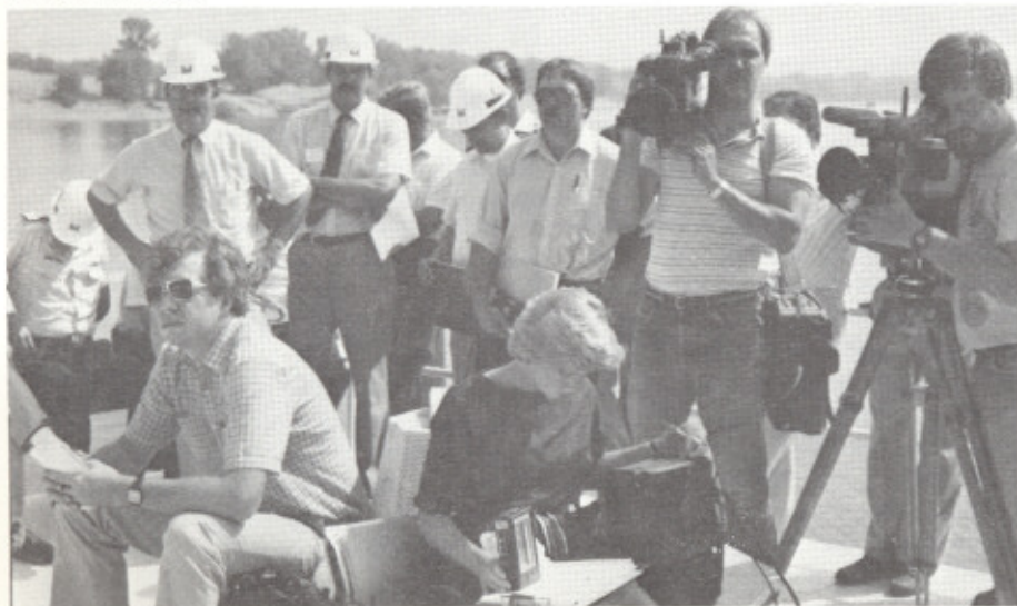
Media concentrated on the project.

The dredging project is anticipated to be completed by June of 1985, at a cost of $2.5 million.