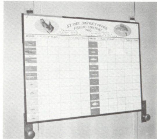
The display board.

Remember, accident prevention is everyone's job.