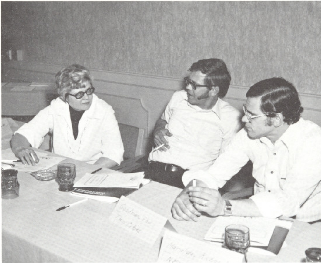
Several student participants at a pilot seminar, held in late May 1980 for OCE, took a break between the executive development classes.

Beginning in 1976, the St. Paul District Training and Development Branch (NCSEP-D) created and designed an inhouse development program for its District employees. The program focuses on the development of managerial and supervisory skills of executives. Plans are for the program to be presented in three parts. Each part consists of five specific topics covered in short classes of 8 to 40-hour seminars. Parts I and II are in current use, while Part III is in the planning stage.