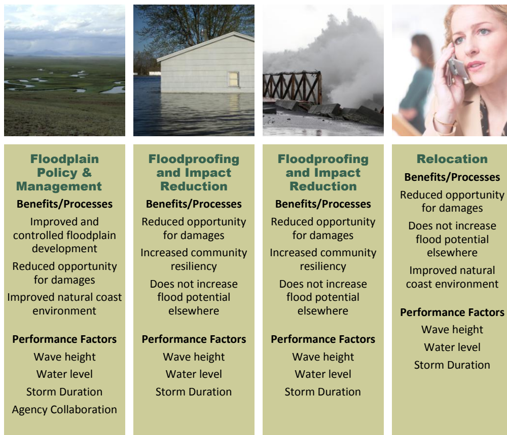
Figure 2. Nonstructural features at a glance. For more detailed information, see summary table in Appendix A.

GENERAL COASTAL RISK REDUCTION PERFORMANCE FACTORS: COLLABORATION AND SHARED RESPONSIBILITY FRAMEWORK, WAVE HEIGHT, WATER LEVEL, STORM DURATION