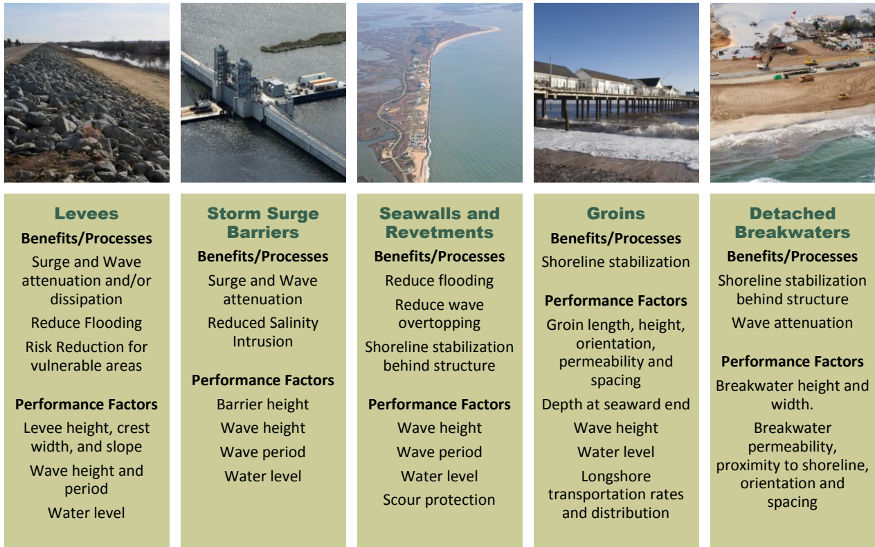
Figure 3. Structural features at a glance. For more detailed information, see summary table in Appendix A.

GENERAL COASTAL RISK REDUCTION PERFORMANCE FACTORS: STORM SURGE AND WAVE HEIGHT/PERIOD, WATER LEVEL