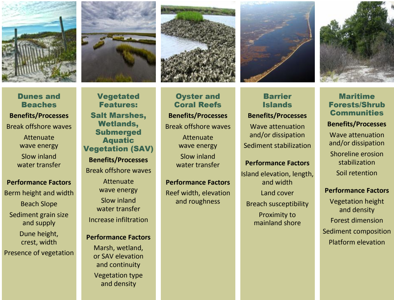
Figure 1: Natural and nature-based features at a glance. For more detailed information, see summary table in Appendix A.

GENERAL COASTAL RISK REDUCTION PERFORMANCE FACTORS: STORM INTENSITY, TRACK, AND FORWARD SPEED, AND SURROUNDING LOCAL BATHYMETRY AND TOPOGRAPHY