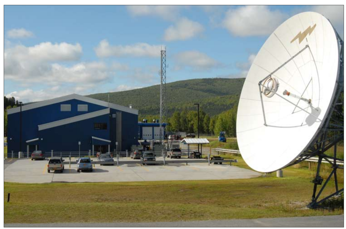
The NOAA Fairbanks Command and Data Acquisition Station's new 20,000 square-foot, $11.9 million facility was built to meet the U.S. Green Building Council's Leadership in Energy and Envrionmental Design Silver rating.

world. The facility is part of a global ground system that detects signals from people in distress who have activated their emergency beacons. In turn, these signals are transmitted to the Coast Guard, Air Force and local emergency departments to support a rescue.