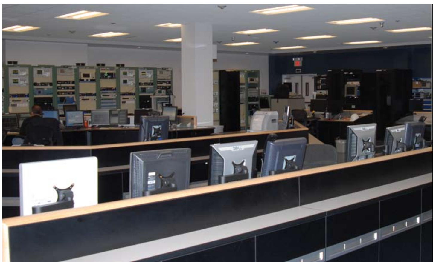
The National Oceanic and Atmospheric Administration's Fairbanks Command and Data Acquisition Station collects information from 26 spacecraft for uses such as weather forecasting, and search and rescue.

Missions include national security and defense as well as saving lives and property. Data gathered at the Fairbanks station has saved the lives of hunters and fishermen in Alaska and around the