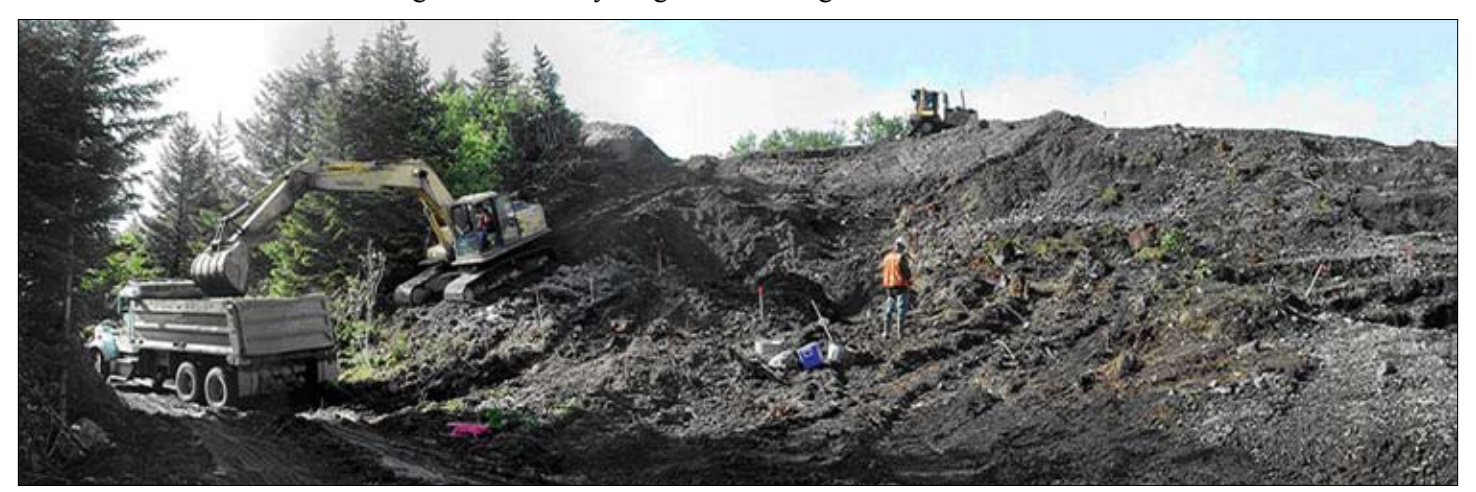
The Cape Chiniak Tracking Station on Kodiak Island, which was contaminated with PCBs and petroleum products is shown above during remediation and below after the site was restored.

In the past decade, the program has received several national-level awards. The Annette Island Project Delivery Team received the Secretary of the Army Environmental Award for environmental restoration, and the Fort Tidball FUDS team won the Secretary of the Army Environmental Award for cultural resources management. The Buskin Beach Tar in Freshwater Area FUDS team received a National Pollution Prevention Roundtable Most Valuable Pollution Prevention Award.