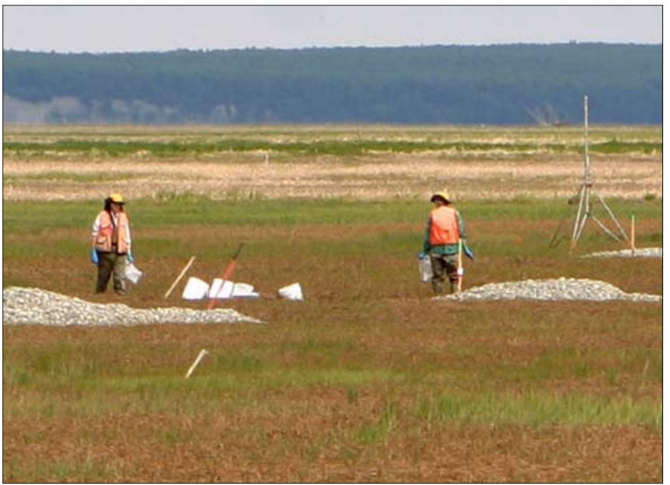
CRREL chemists sample the perimeter of the gravel caps for traces of white phosphorus. These caps are placed in winter with gravel secured by the Alaska District.

"There may be a time in the future where we go back and do more remediation based on long-term monitoring, but for all intents and purposes remediation is complete,' said Collins.