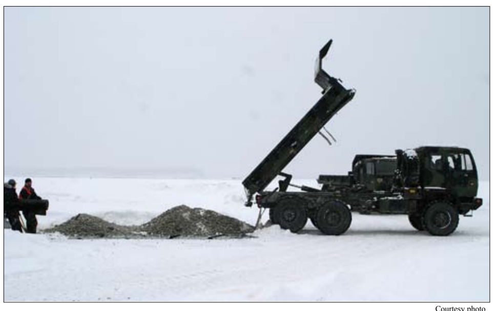
Assisted by Company C, 84th Engineer Combat Battalion (Heavy), CRREL workers place gravel to cap small ponds at Eagle River Flats. These caps prevent waterfowl from feeding in areas that are contaminated with white phosphorus but containing water amounts too small to pump.

numerous agencies involved. CRREL became involved because of its expertise in munitions analysis, and provided the primary project engineers directing the cleanup.