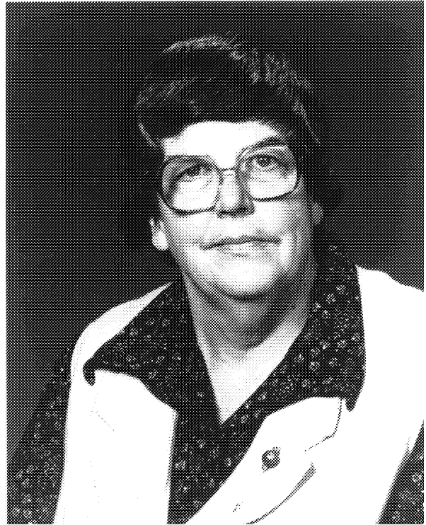
Fig. 1. Mary Gibbons Natrella.

Mary Natrella had a special gift for elucidating difficult statistical concepts, and these expositions are the strength of the book. The workbook style of the volume probably accounts for its popularity and acceptance by statisticians and non-statisticians alike. It is replete with examples; the page for each example is divided, with the statement of the problem and recommended solution on the left-hand side and detailed step-by-step calculations on the right-hand side. Mary