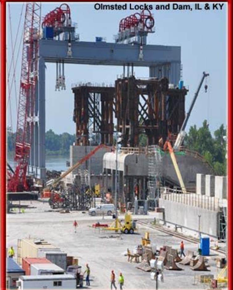
Olmsted Locks and Dam, IL & KY