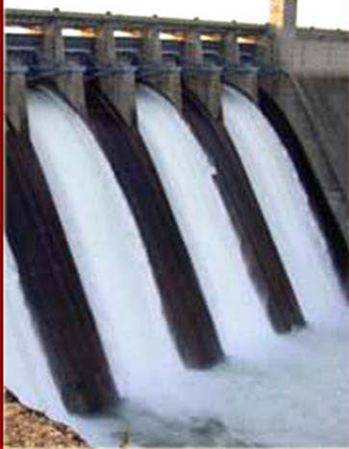
Table Rock Dam and Lake, MO & AR