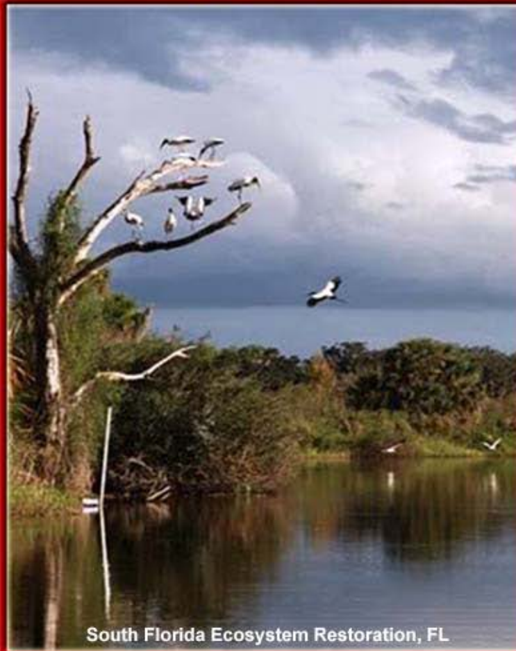
South Florida Ecosystem Restoration, FL