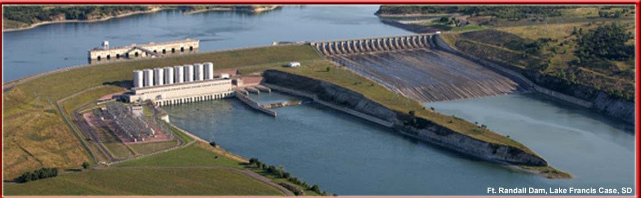
Ft. Randall Dam, Lake Francis Case, SD