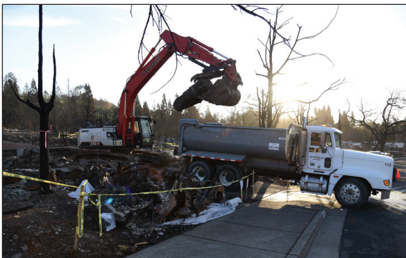
[Above] Debris removal crews work around-the-clock in the Fountaingrove neighborhood of Santa Rosa. [Right] The visible scars of the worst wildfire disaster in California's history are shown here in this family home in Santa Rosa.