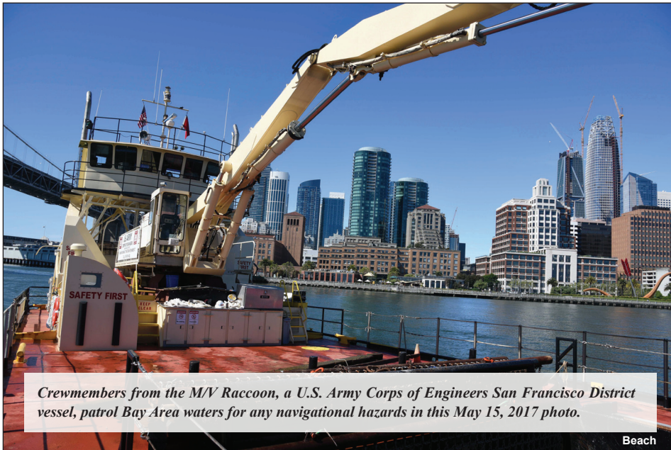
Crewmembers from the M/V Raccoon, a U.S. Army Corps of Engineers San Francisco District vessel, patrol Bay Area waters for any navigational hazards in this May 15, 2017 photo.