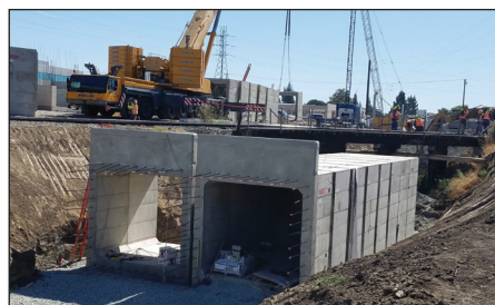
Crews demolish the old trestle bridge [right], while installing a series of box culverts [above] at Berryessa Creek in Milpitas Oct. 2.