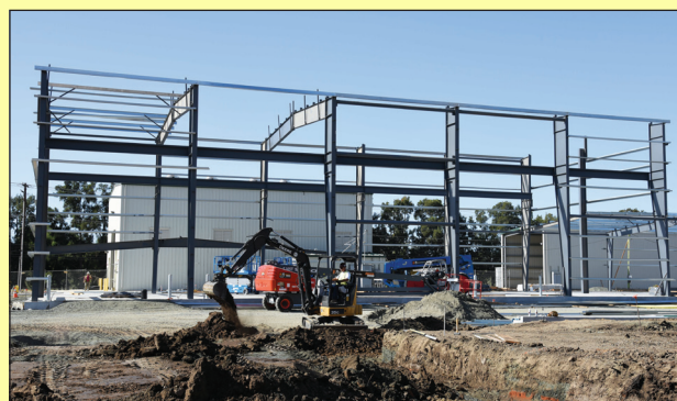
A contractor operates an excavator at the Military Ocean Terminal Concord, where the San Francisco District is overseeing the construction of this new maintenance facility on post.

The projects being overseen by the Corps are slated to be completed by next June and several more are in the pipeline.