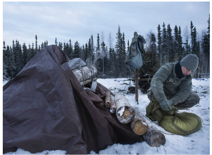
Eielson AFB Cool School Attendee

Because of the Department of the Air Force's inherent rapid-response and long-range capabilities, Airmen will likely be first to the scene in the event of any Arctic disaster. Through air and space systems that build situational awareness, establish communications, or deliver Arctic survival packages, the Department's substantial capabilities often augment other departments' HADR and personnel recovery missions in the Arctic. To ensure these capabilities in the future: