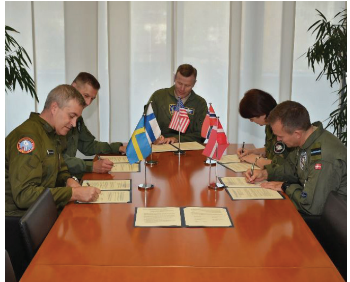
Air Chiefs from Sweden, Finland, U.S., Norway, Denmark sign letter of intent to develop Arctic Challenge Air Exercise in 2017

Ally and partner nations that comprise the Arctic share unique experiences, capabilities, and security interests.