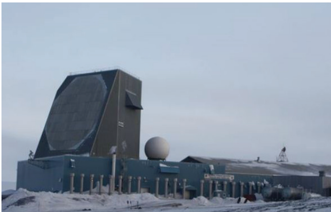
Thule Early Warning Radar