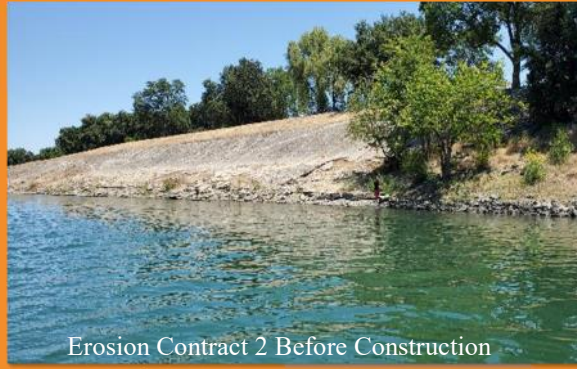
Erosion Contract 2 Before Construction