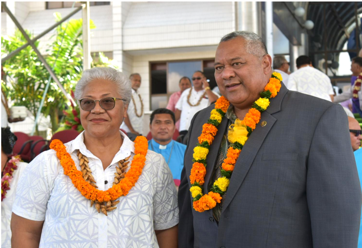
Pictured above: Her Excellency Fiame Naomi Mataafa, Prime Minister of the Independent State of Samoa and Honorable Lemanu Palepoi Sialega Mauga, Governor of American Samoa at the Atoa o Samoa Executive Meeting Official Opening Ceremony.

“You have shared your wisdom with us, renewed our partnership in many of our efforts in our fight against climate change, preserving our culture and language, and by building up our workforce by allowing training through the school of medicine, maritime, and technical institute”