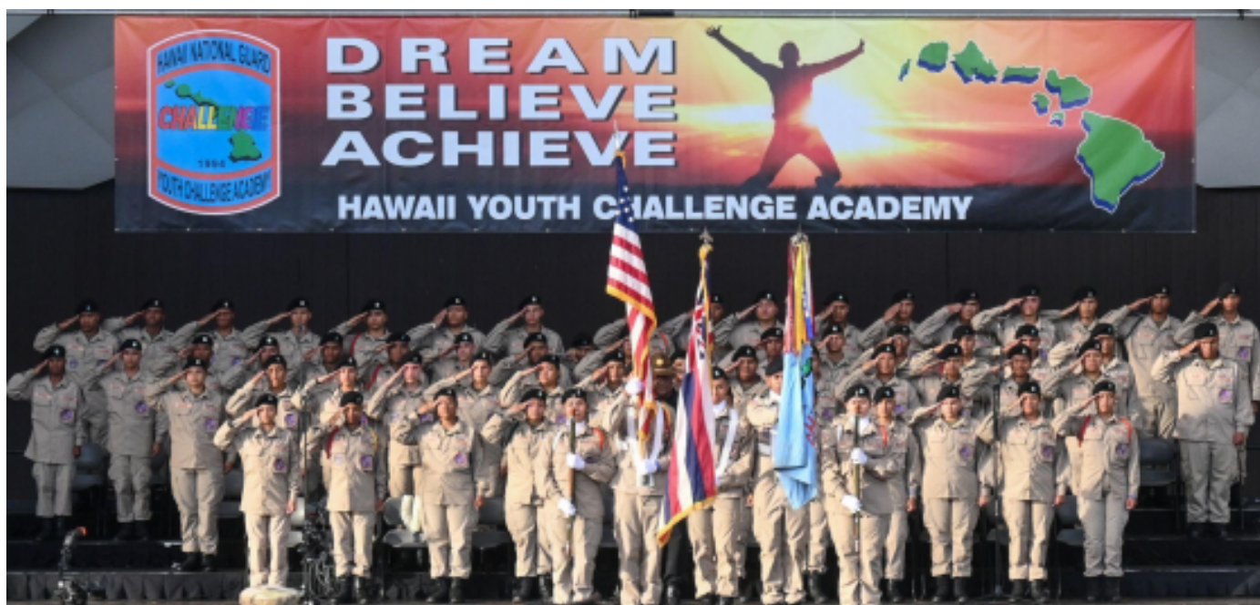
Pictured: Hawaii National Guard Youth Challenge Academy Graduating Class 22-02 (58).

On Thursday, June 15, 2023 the Hawaii National Guard Youth Challenge Academy hosted a graduation ceremony at the Tom Moffatt Waikiki Shell, Honolulu, Hawaii, where sixty-five cadets were recognized for their achievements. Twenty five students departed American Samoa in January 2023 to attend this Academy. One student returned home, and the remaining twenty four students excelled and graduated.