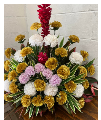
The Department of Youth and Women Affairs completed its Floral Arrangements and Handicraft program on June 21, 2023.