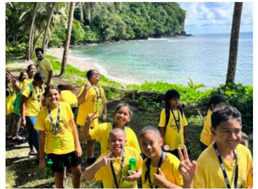
The Agency for Better Living Endeavors (ABLE) is on their second week of Discovering Amerika Samoa program. The children participating in this Summer's program visited farms, various ASG departments, and learning more about the people of Amerika Samoa.