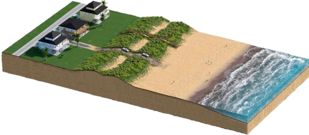
Figure 1: Conceptual rendering of a proposed dual dune beach and dune system with walkovers and driveovers.

There will be no changes to the number of or location of public access points with the proposed CSRSM beach and dune nourishment and sediment management plan on South Padre Island. Walkovers will be constructed and/or rebuilt, as necessary, to maintain accessibility post-construction (Figure 1).