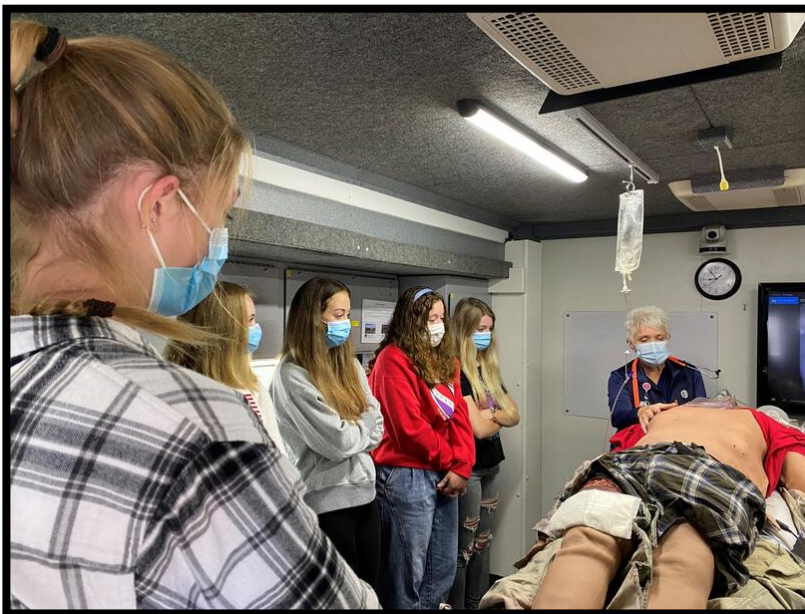
Canton High School students watch as Sanford Health providers demonstrate how they respond to an emergency.