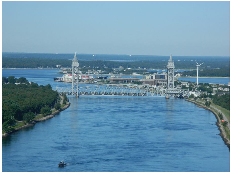
The Cape Cod Canal Railroad Bridge in its lowered position.

https://www.legacy.com/us/obituaries/bostonglobe/name/robert-mirick-obituary?id=51713018