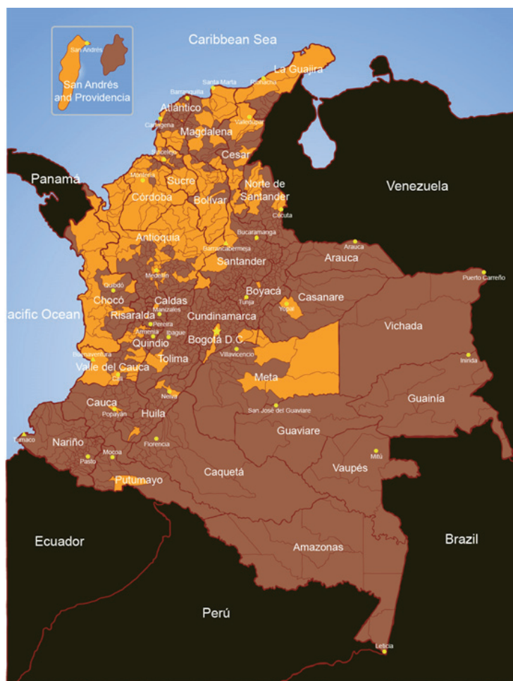
Urabeños area of influence, 2013.