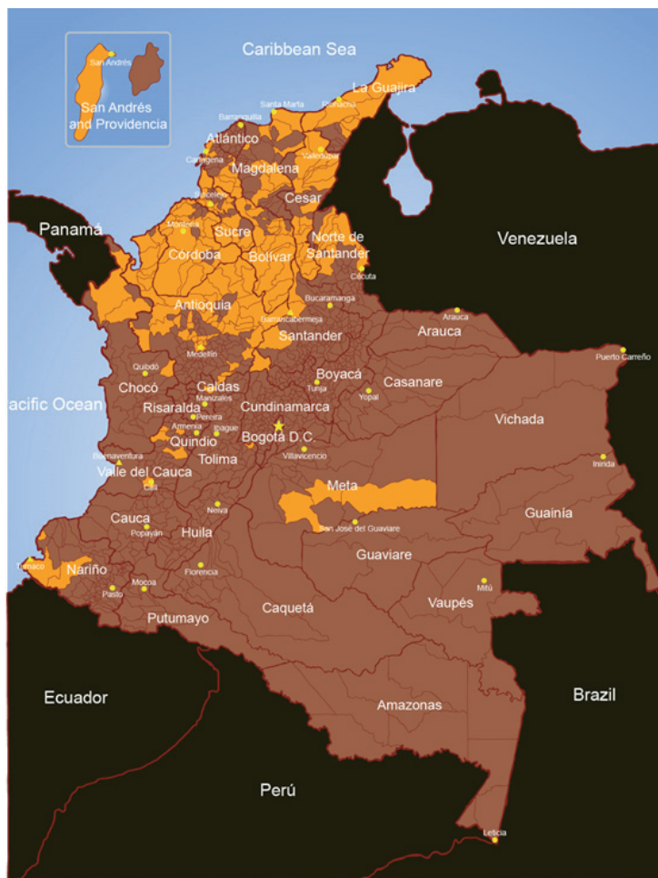
Urabeños areas of influence, 2011

By 2011, the Rastrojos were the most powerful BA-CRIM and the dominant criminal power in Colombia. They had a presence in up to 23 of Colombia’s 32 departments 16 by some estimates, and had a rural military force estimated to be in excess of 1,000 fighters 17 , as well as control over many oficinas de cobro, sicarios and money laundering networks.