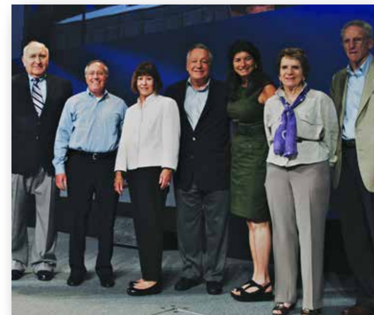
Zenith Society members accept the Jerome H. Stone Philanthropy Award for Alzheimer's Research during AAIC 2013.