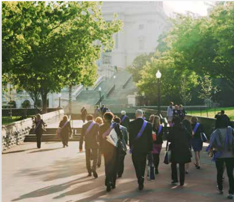
Alzheimer's Association Ambassadors go to Capitol Hill to use their voice in the fight against Alzheimer's.