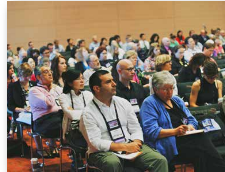
AAIC attendees listen during a scientific presentation.

For more information on the dementia science shared for the first time at AAIC 2013, visit alz.org/AAIC .