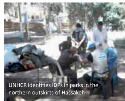
UNHCR identifies IDPs in parks in the northern outskirts of Hassakeh

UNHCR response shall continue to ensure that the most vulnerable, not only in Hassakeh, but throughout Syria, are reached.