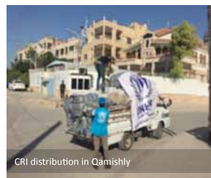
CRI distribution in Qamishly