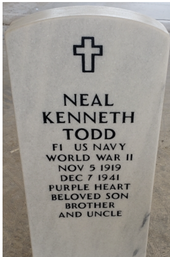
UPRIGHT HEADSTONE WHITE MARBLE (U) OR LIGHT GRAY GRANITE (V)

This headstone is 42 inches long, 13 inches wide and 4 inches thick. Weight is approximately 230 pounds. Variations may occur in stone color, and the marble may contain light to moderate veining. Additional inscription is limited to 15 characters (including spaces) up to four lines maximum.