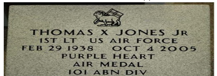
SMALL FLAT GRANITE (L)

This grave marker is 18 inches long, 12 inches wide, and 3 inches thick. Weight is approximately 70 pounds. Variations may occur in stone color. Additional inscription is limited to 27 characters (including spaces) up to two lines maximum.