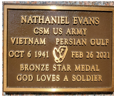
BRONZE NICHE (Z)

This niche marker is 8-1/2 inches long, 5-1/2 inches wide, with 7/16 inch rise. Weight is approximately 3 pounds; mounting bolts and washers are furnished with the marker. Used for columbarium or mausoleum interment. Also provided to supplement a privately-purchased, permanent and durable headstone or marker for eligible Veterans who died on or after November 1, 1990 and are buried in a private cemetery. Additional inscription is limited to 27 characters (including spaces) up to two lines maximum.