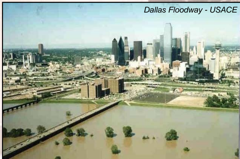
Dallas Floodway - USACE