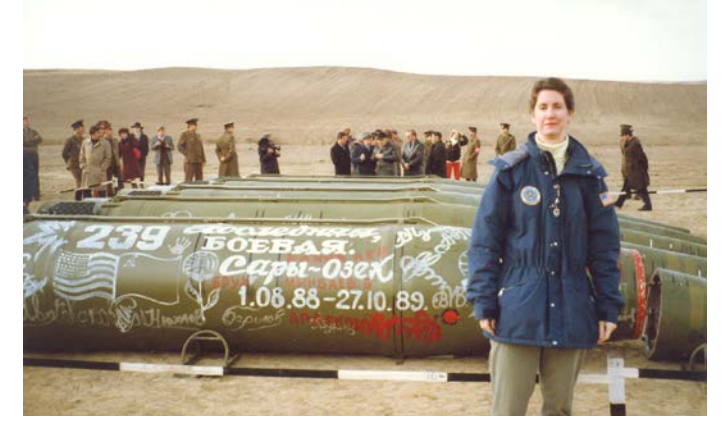
Ambassador Eileen Malloy, chief of the arms control unit at the U.S. Embassy in Moscow at the destruction site in Saryozek in early 1990.

Allies are firmly committed to the preservation of effective international arms control, disarmament and non-proliferation. Therefore, the Alliance will continue to uphold, support and further strengthen arms control, disarmament and non-proliferation as a key element of Euro-Atlantic security.