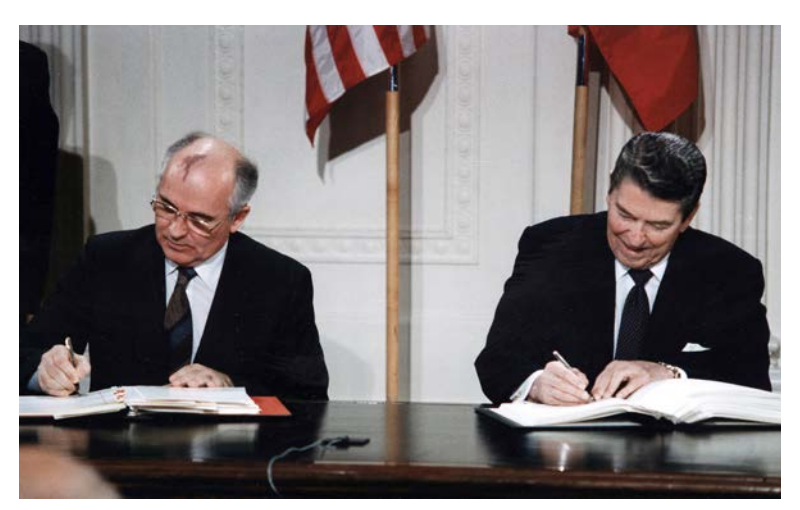
Soviet President Mikhail Gorbachev and United States President Ronald Reagan sign the INF Treaty at the White House, Washington, DC, in 1987. A historic moment for Alliance security.

The Intermediate-Range Nuclear Forces Treaty, or INF Treaty, is crucial to Euro-Atlantic security. It eliminated a whole category of nuclear weapons that threatened Europe in the 1980s. But the 9M729 or SSC-8 missile system developed and deployed by Russia in recent years violates the INF Treaty, and poses a significant risk to Alliance security. The United States has raised its concerns more than 30 times with Russia, starting under the Obama administration. NATO Allies agree with the United States' assessment that Russia is in material breach of its obligations under the INF Treaty, and have called upon Russia to return to full and verifiable compliance.