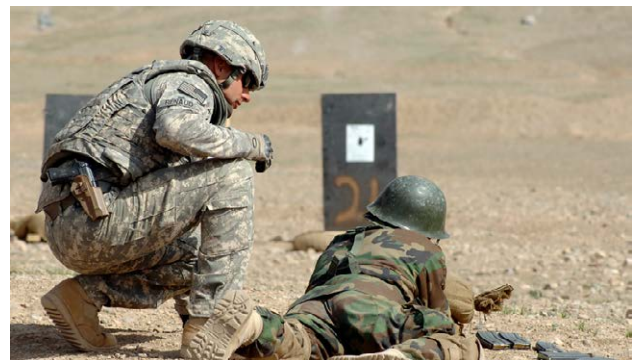
NATO troops train and advise the Afghan National Army