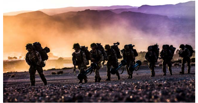
Allied forces training during NATO Exercise Trident Juncture 2015

Since 2014, NATO has implemented the biggest increase in its collective defence since the Cold War. For instance, we have now deployed four multinational battlegroups to Estonia, Latvia, Lithuania and Poland. Their purpose is not to provoke a conflict, but to prevent one.