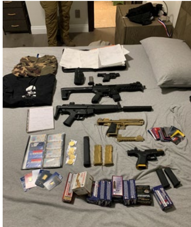
During the execution of a UI fraud search warrant, OIG agents recovered multiple firearms, UI debit cards, and notebooks containing personally identifiable information.

As of January 2023, our pandemic investigations have resulted in upwards of 700 search warrants executed and over 1,200 individuals charged with crimes related to UI fraud. These charges resulted in more than: 500 convictions; 11,000 months of incarceration; and $905 million in investigative monetary results. We have also referred over 23,000 fraud matters that do not meet federal prosecution guidelines back to the states for further action.