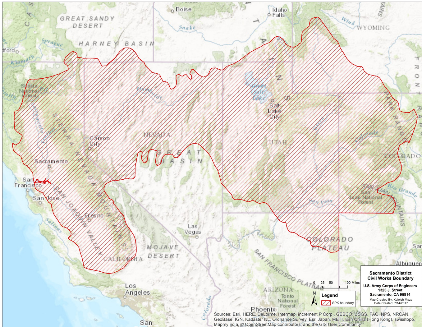
Figure 1. Map showing the USACE Sacramento District civil works boundary.