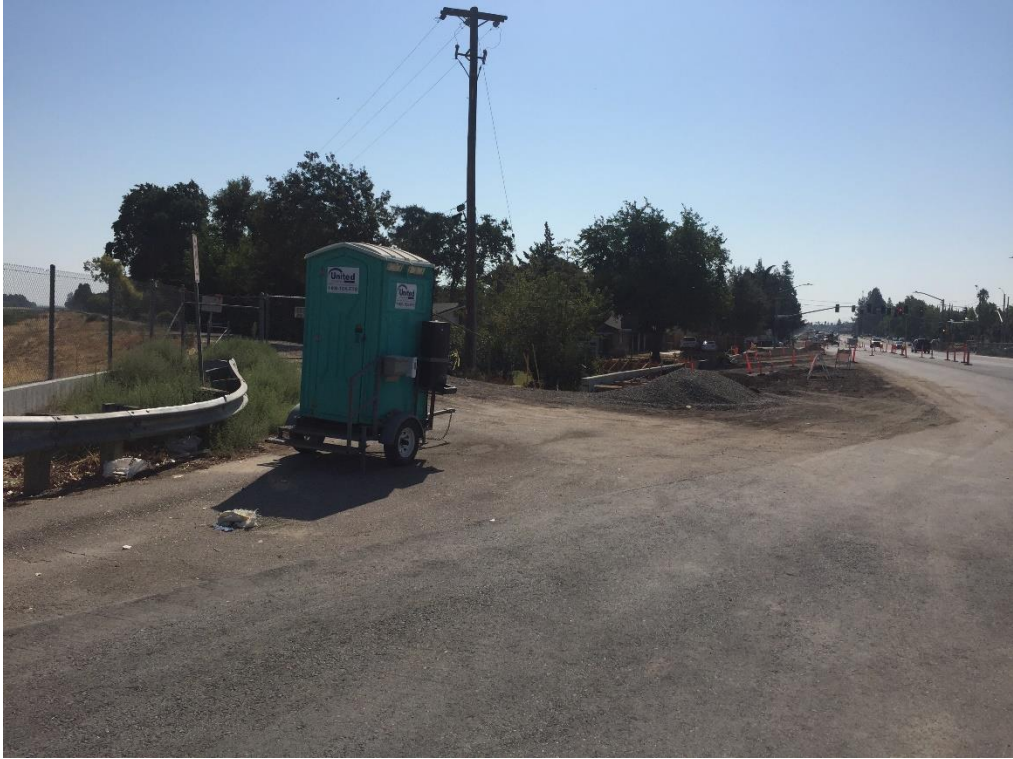
Thornton Road Widening Project Conform Work at Bear Creek (Southeast Side of Bear Creek Bridge on Thornton Road).