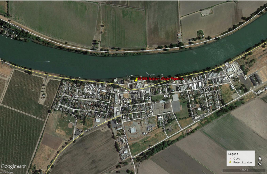
Figure 2. Proposed project location map.