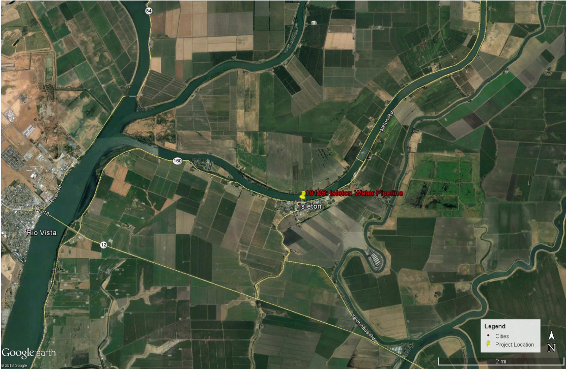
Figure 1. Site vicinity map.