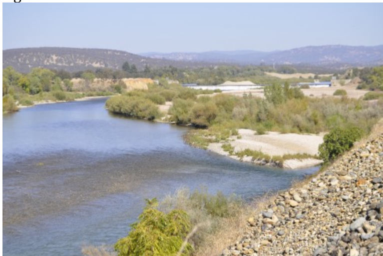
Figure 5. Yuba Goldfields.

The Yuba Goldfields, located from approximately 8 to 16 miles upstream of Marysville, are dominated by approximately 20,000 acres of dredger tailings that were reworked from hydraulic mine waste. Dredging of gold from the hydraulic waste in the Goldfields began in 1902, and by 1910, 15 dredges were operating in the lower Yuba River. The area has been dredged and re-dredged intermittently throughout the years, and dredging continues today.