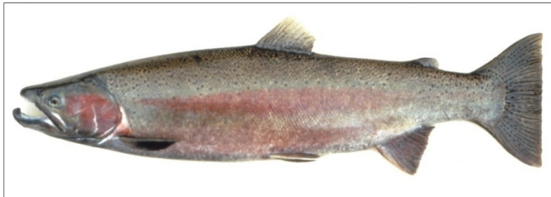
Figure 7. Steelhead.

Although not numerous, captures of (over-summer) holdover juvenile O. mykiss were observed in the RST captures primarily from October through mid-April (RMT 2013). These fish likely reared in the river over the previous summer, representing an extended juvenile rearing strategy characteristic of holdover juvenile O. mykiss . Juvenile O. mykiss that exhibit extended rearing in the lower Yuba River are assumed to undergo the smoltification process and volitionally emigrate from the river, and are referred to as yearling+ smolts.