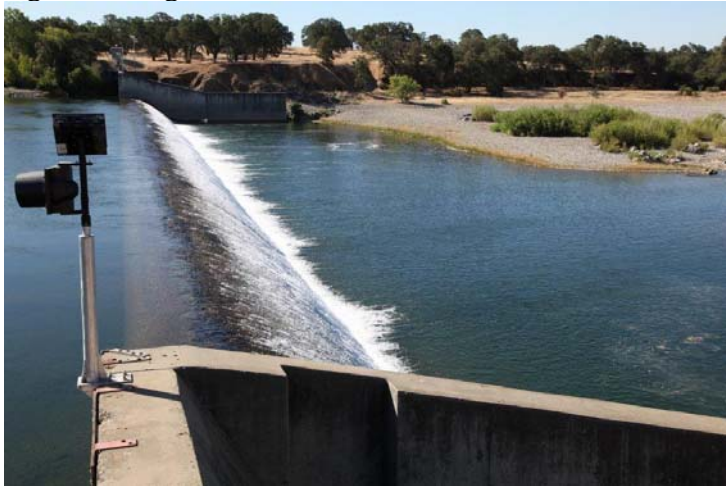
Figure 3. Daguerre Point Dam.