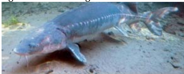
Figure 8. Green Sturgeon.

Because green sturgeon have rarely been observed in the lower Yuba River, no site-specific habitat utilization information is available. However, Daguerre Point Dam is acknowledged to be impassible to green sturgeon.