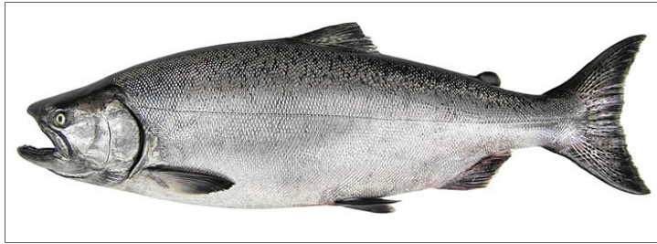
Figure 6. Chinook salmon.