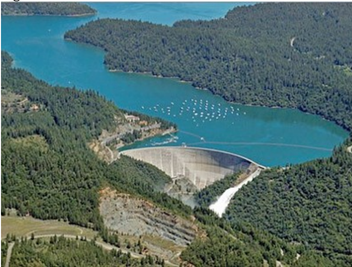
Figure 4. New Bullards Bar Dam.