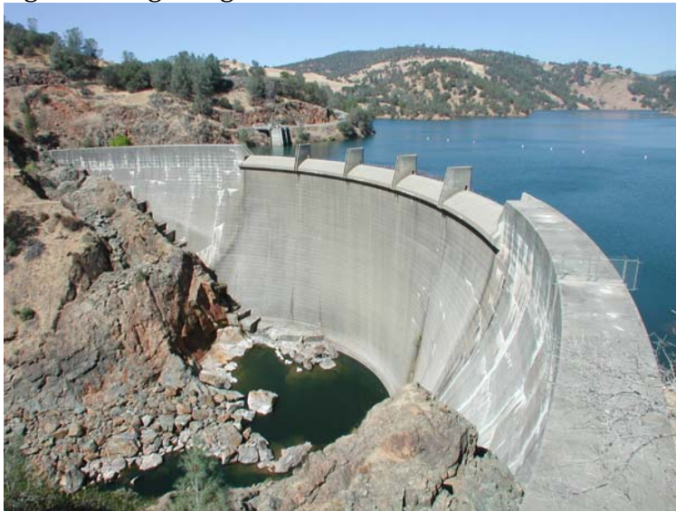
Figure 2. Englebright Dam.

The primary watercourses of the upper Yuba River Watershed are the South, Middle, and North Yuba rivers. The South Yuba river flows into Englebright Lake. The Middle Yuba River flows into the North Yuba River and together they are referred to as the upper Yuba River. Beginning at the confluence of the North Yuba and the Middle Yuba rivers, the mainstem upper Yuba River flows approximately 7.8 miles downstream to Englebright Dam. Englebright Dam's reservoir extends approximately 8 miles from its high water surface elevation at RM 32.2 to the Englebright Dam at RM 24 (YSF 2013). Below Englebright Dam, the lower Yuba River reach extends approximately an additional 24 miles downstream to the confluence with the Feather River. The study area begins in the city of Marysville and extends upstream approximately 90 miles, past Sierra City, California, in Sierra County.