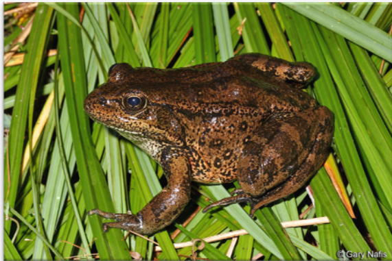
Figure 9. California Red-Legged Frog.