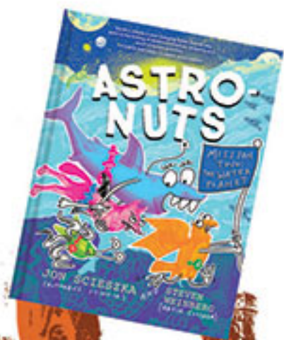
AstroNuts Mission Two: The Water Planet.

All rights reserved Jon Scieszka/Steven Weinberg 2020