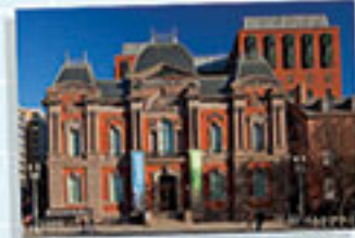
American Art Museum and Renwick Gallery