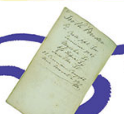
James Smithson's Recipe for Tooth Powder

The AstroNuts got to work. AlphaWolf found George Washington's arm in the National Portrait Gallery. LaserShark found the Wright Brothers' 1903 Flyer in the National Air and Space Museum. SmartHawk found Charlie Parker's saxophone in the National Museum of African American History and Culture. StinkBug found the Inverted Jenny stamp in the National Postal Museum.