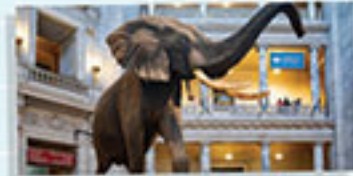
Natural History Museum