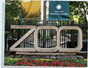
Smithsonian's National Zoo