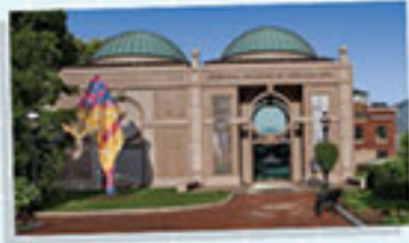
African Art Museum