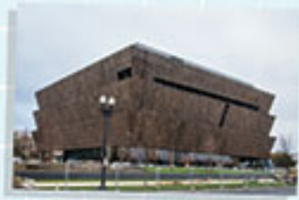
African American History and Culture Museum