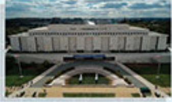
American History Museum