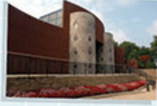
Anacostia Community Museum