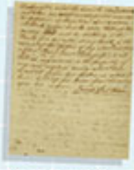
Smithsonian Institution Archives