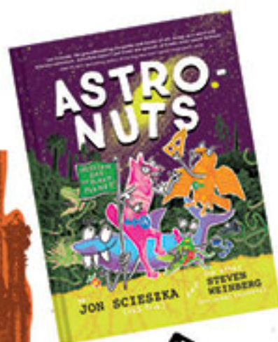
AstroNuts Mission One: The Plant Planet