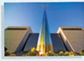
Air and Space Museum and Udvar-Hazy Center