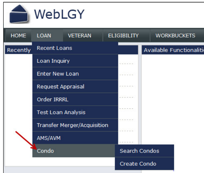
Figure 1. WebLGY Condo Navigation.

Condominium functions are located from the WebLGY top-navigation menu under Loan > Condo , as shown in the figure below.