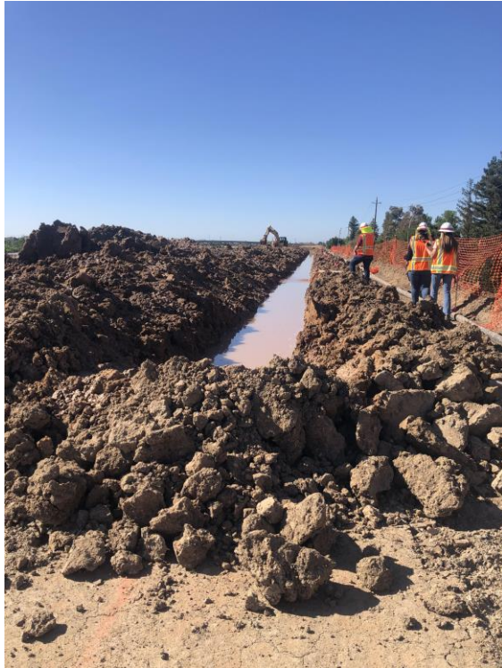
Reach H Levee Construction Summer / Fall 2021