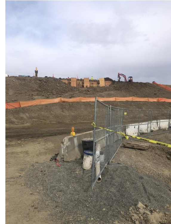
Pumping Plant #4 Construction Fall 2021