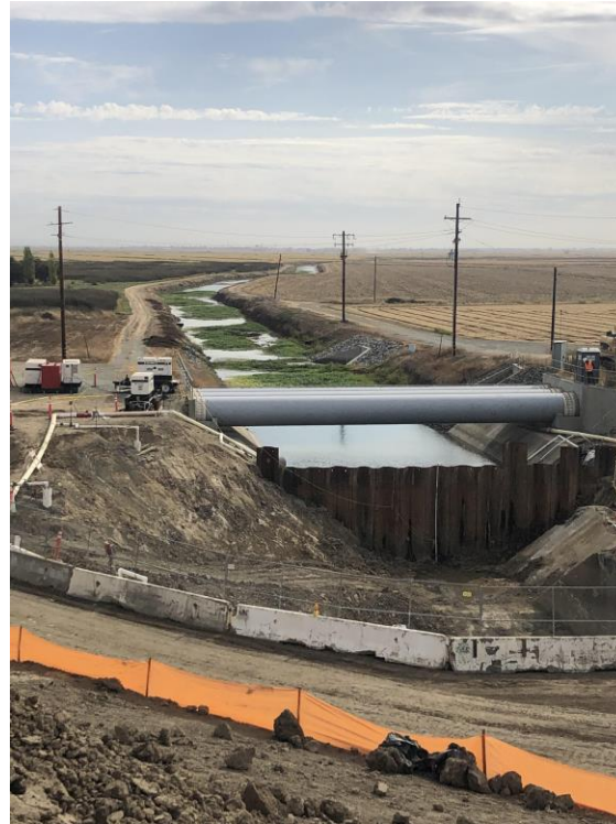
Pumping Plant #4 Construction Fall 2021